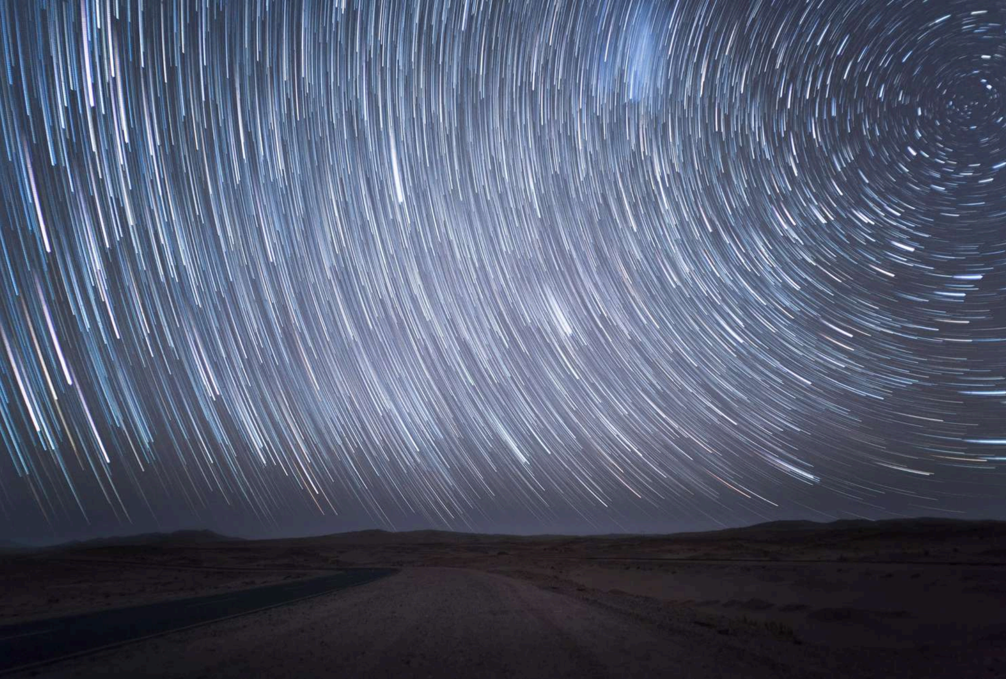
Star trails and Southern pole in Namib desert