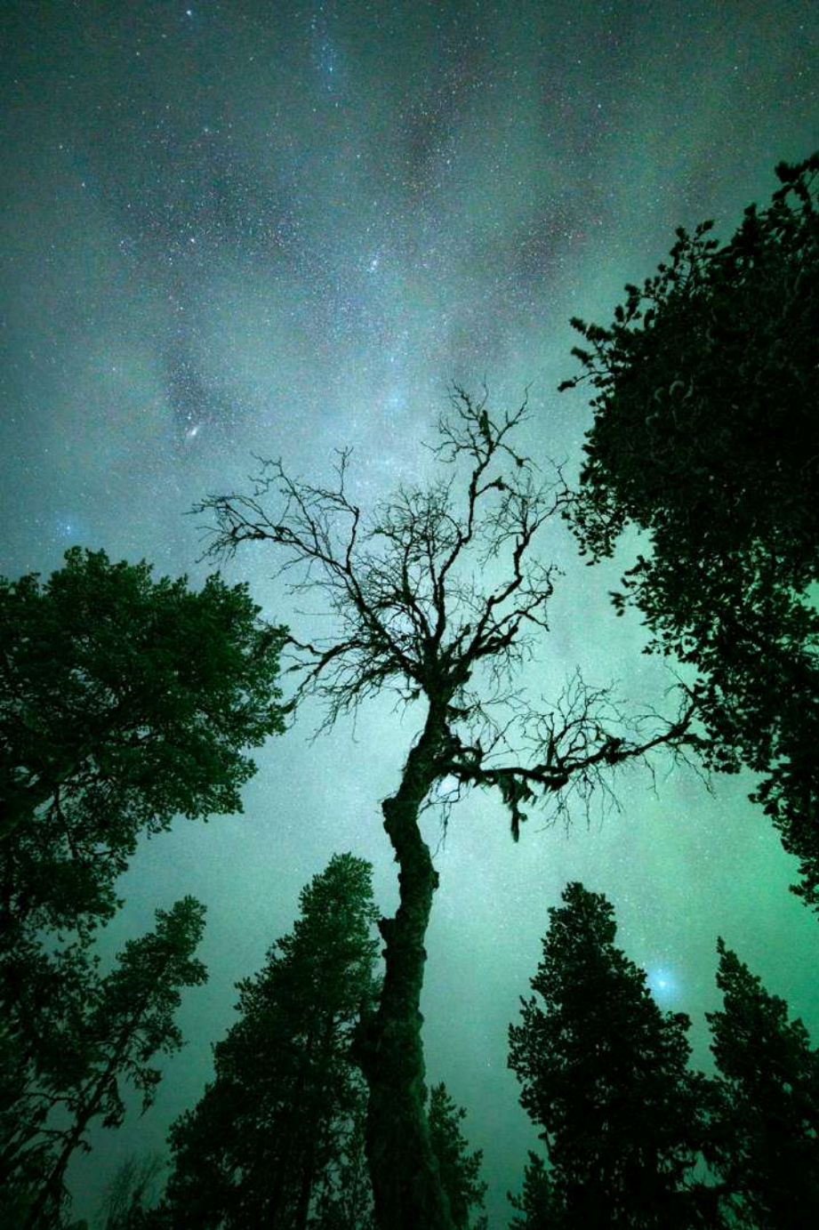
Northern Lights in Iceland