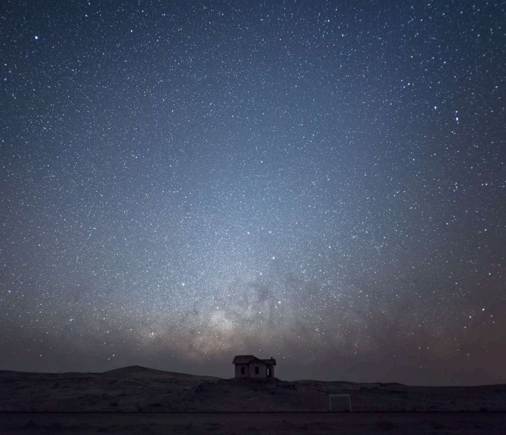
Night in Namib desert