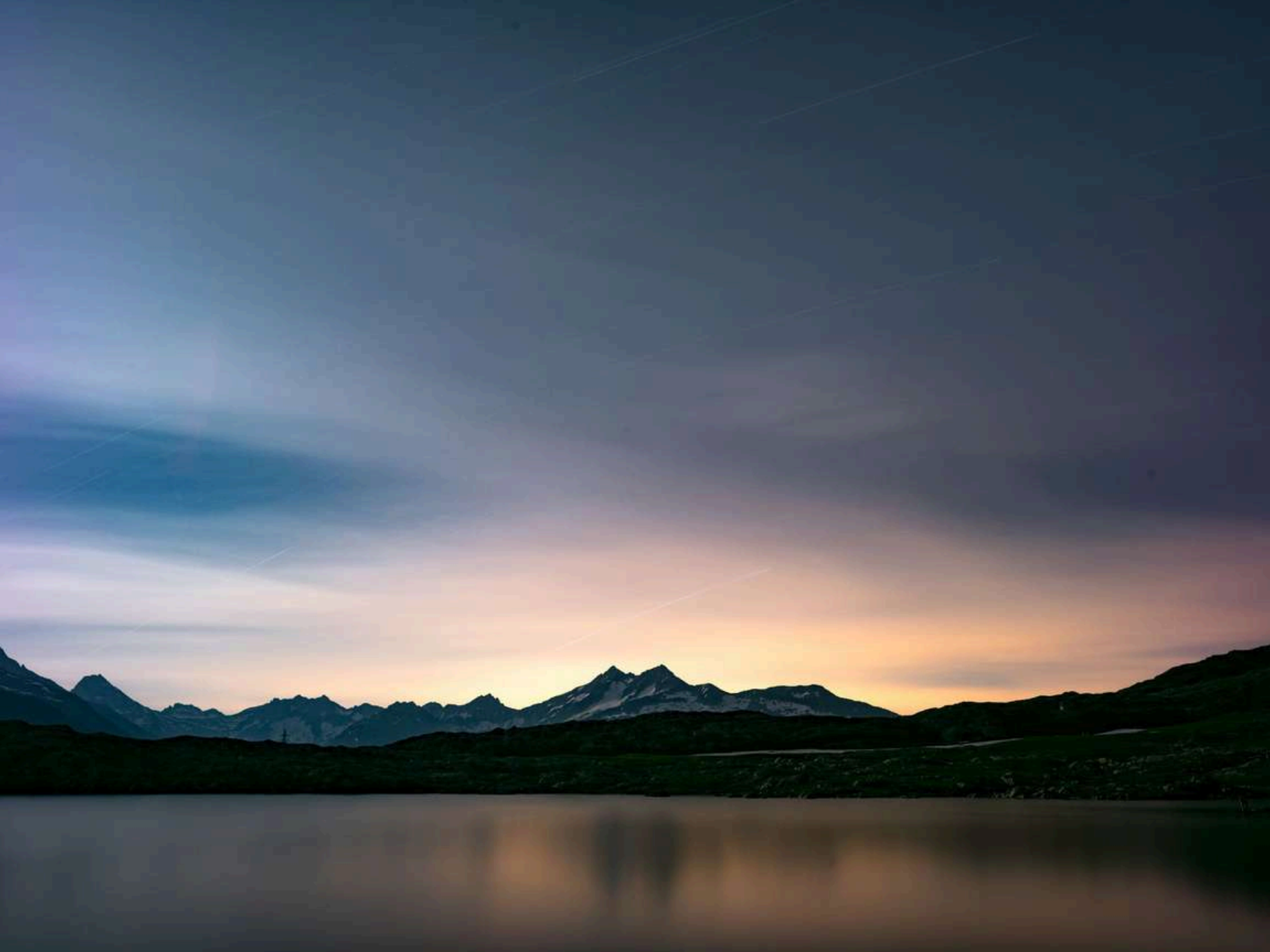
Full moon in Switzerland