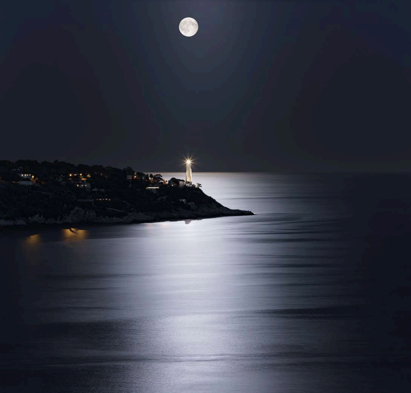
Full moon in France