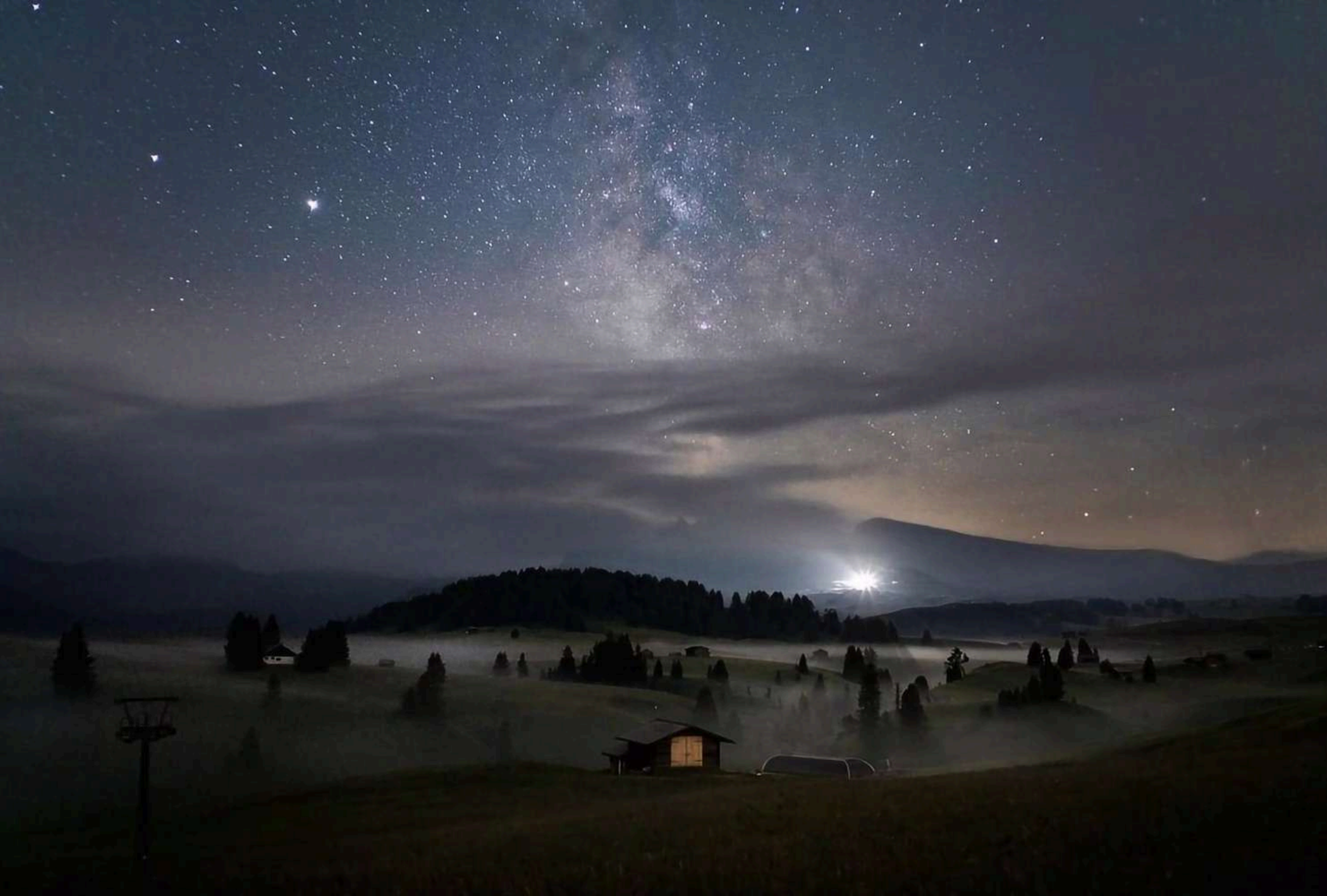
Foggy night in Dolomites