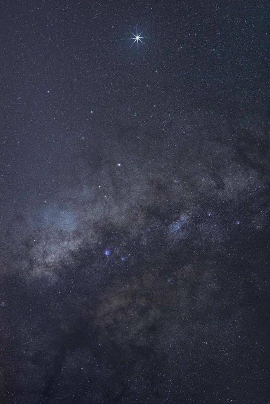
Jupiter and Milky Way, France