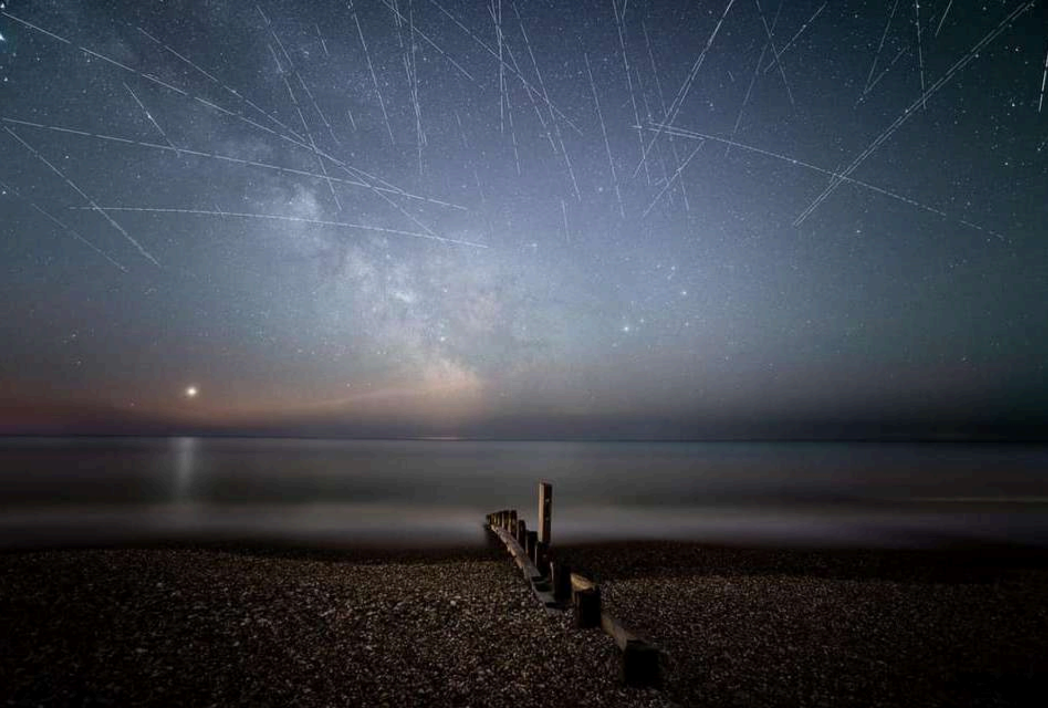
Satellites traffic jam in empty skies in the midst of COVID lockdown