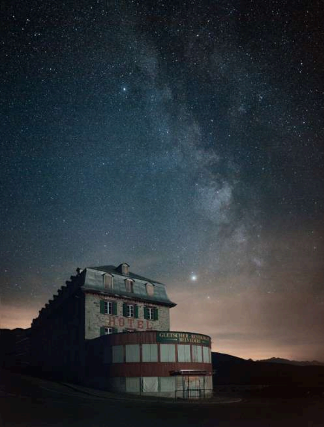
Abandoned hotel in the Swiss Alps