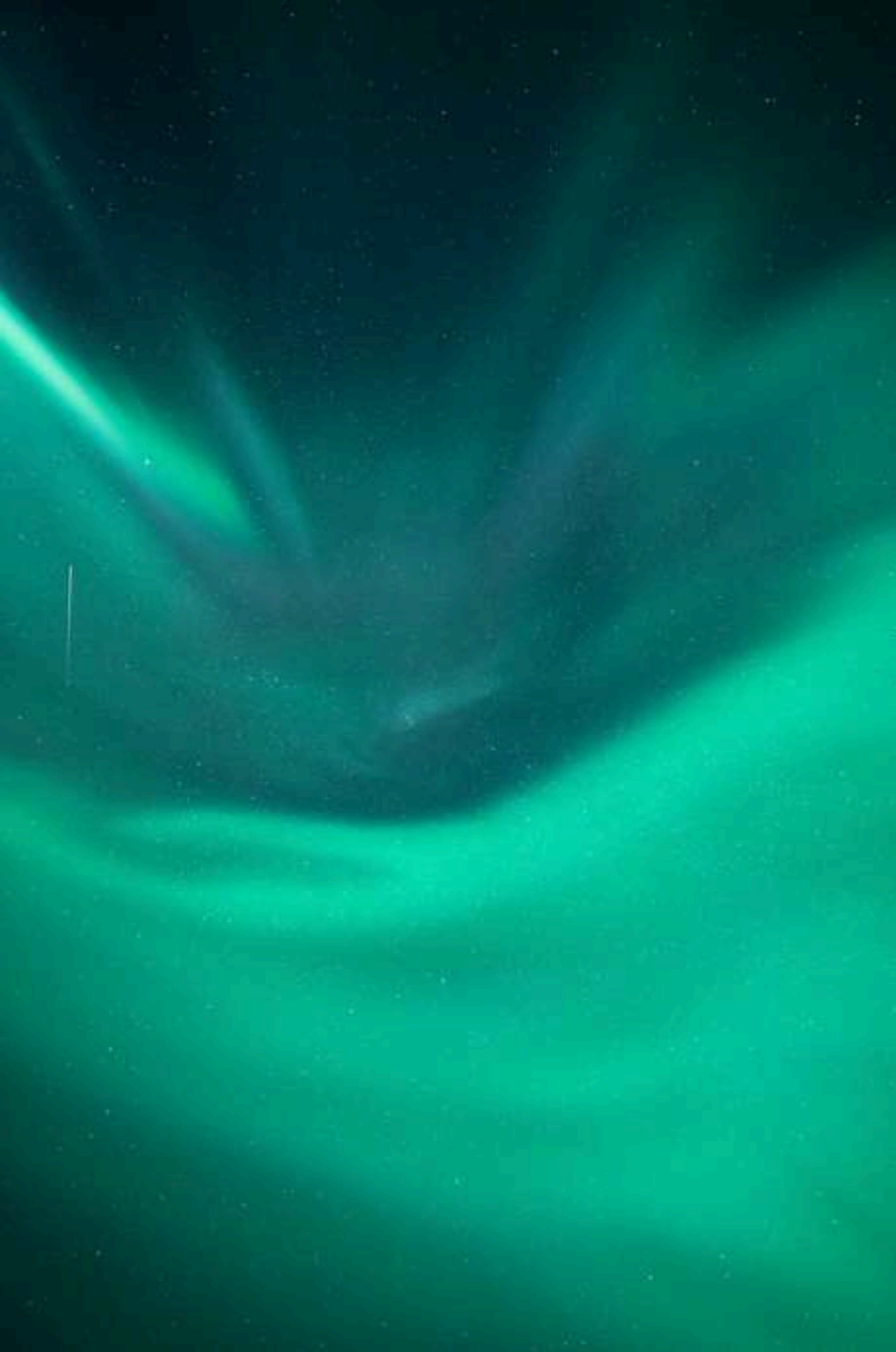
Northern Lights in Sweden