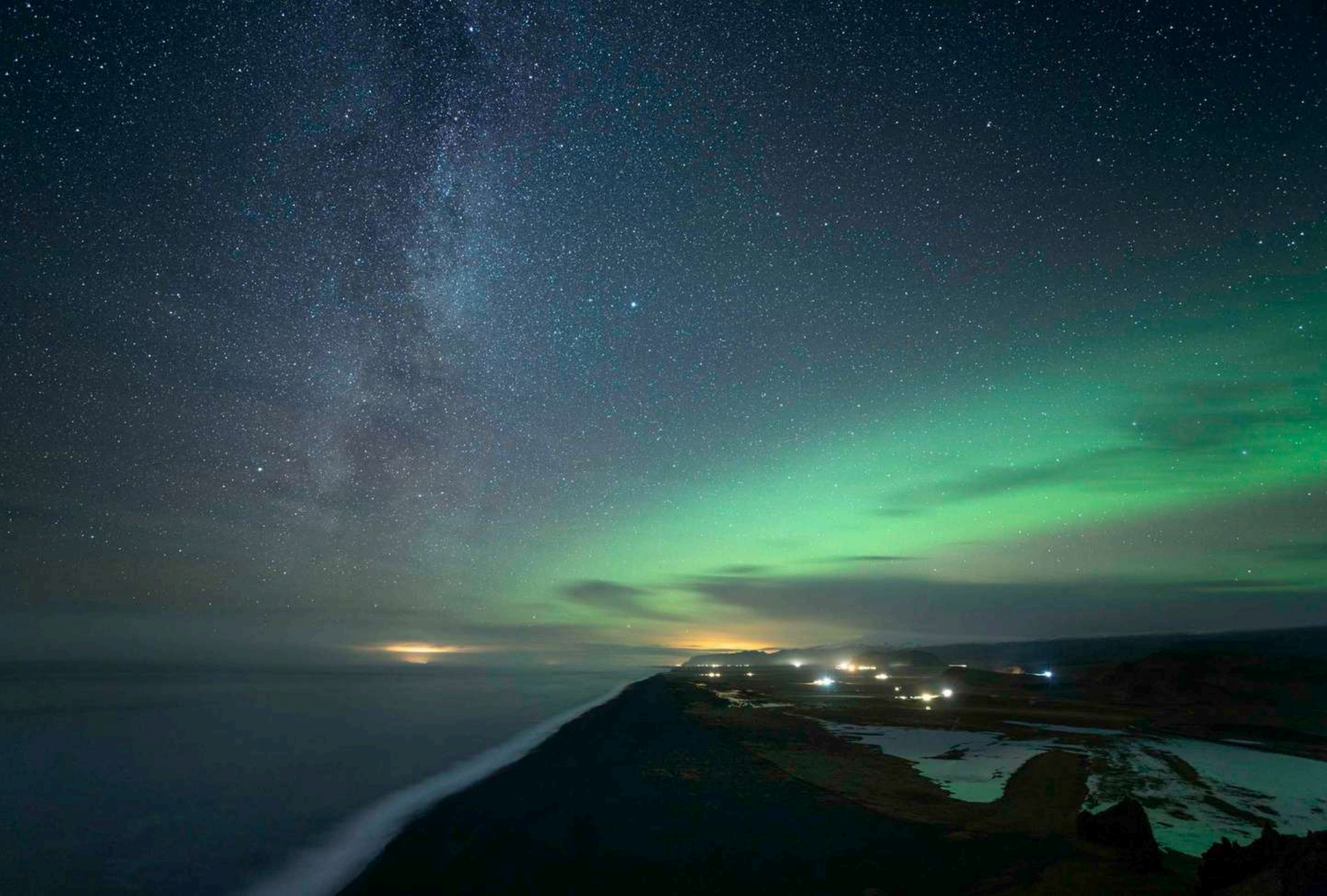
Northern Lights in Iceland