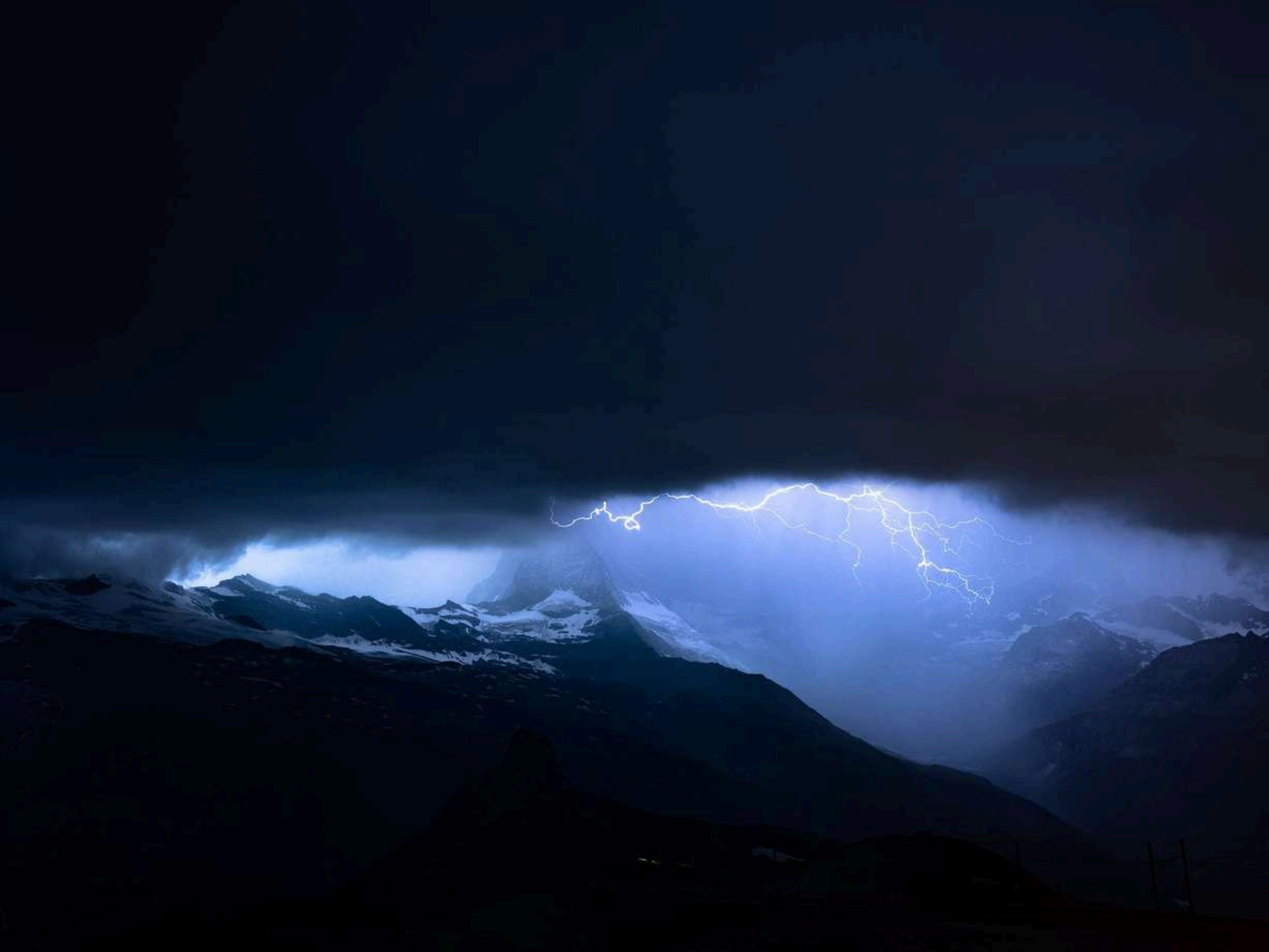
Lightning storm over Matterhorn