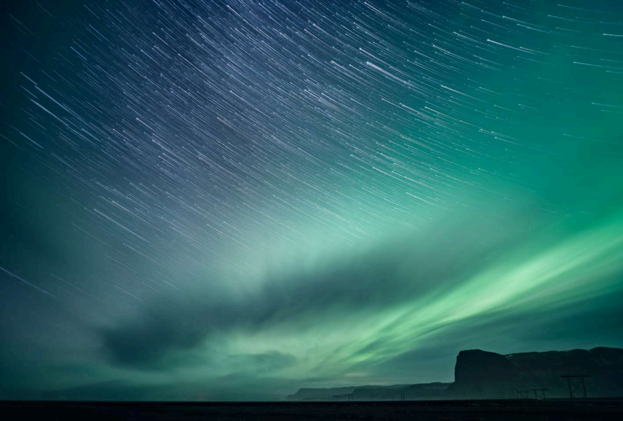
Northern Lights in Iceland and startrails