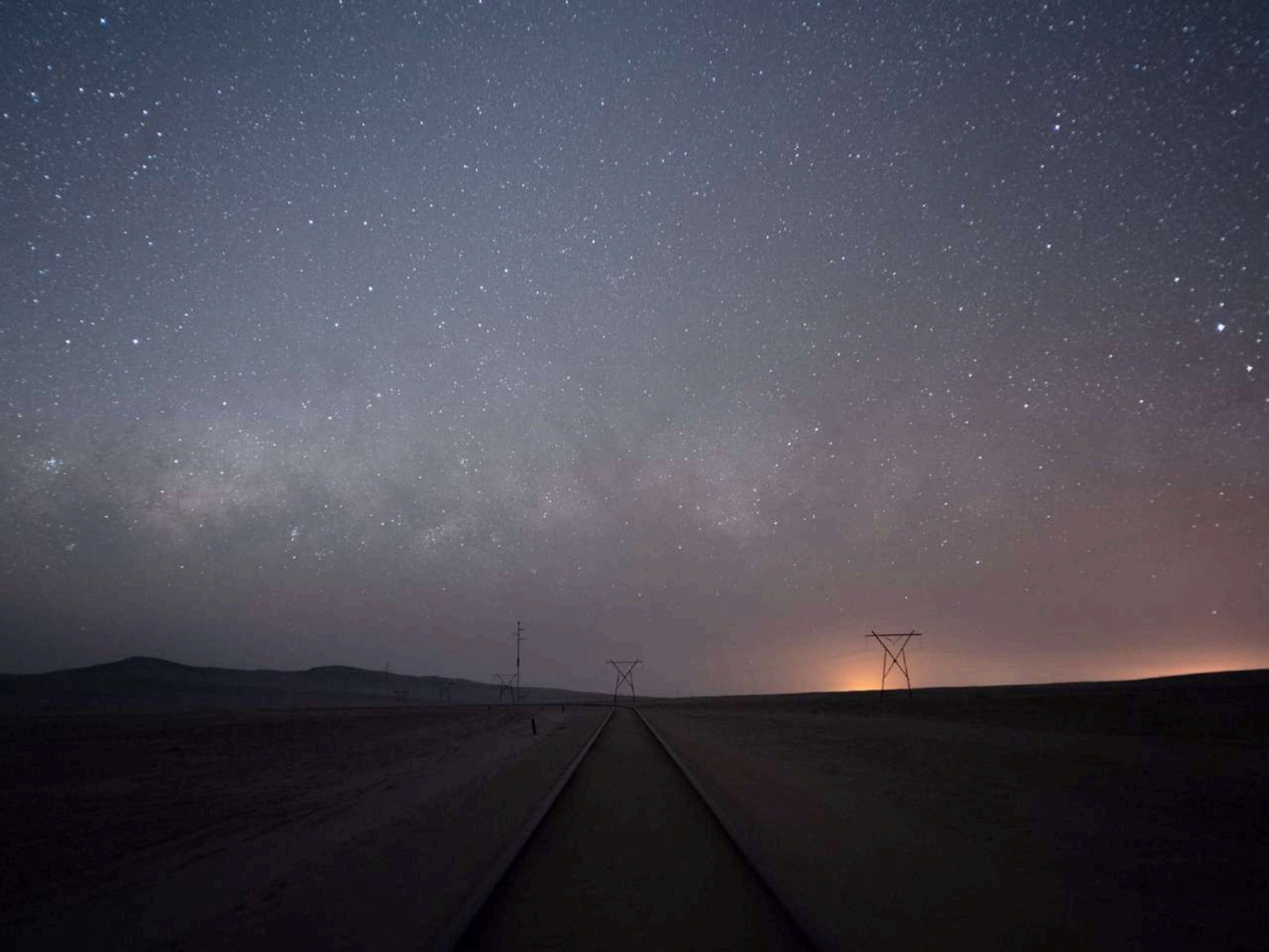
Night in Namib desert