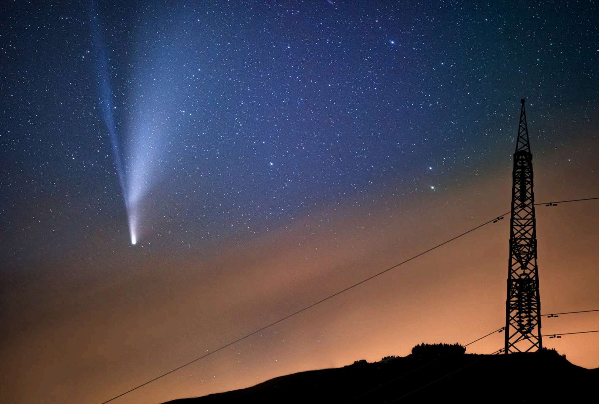
Comet Neowise that is believed to be back in 6953 years.